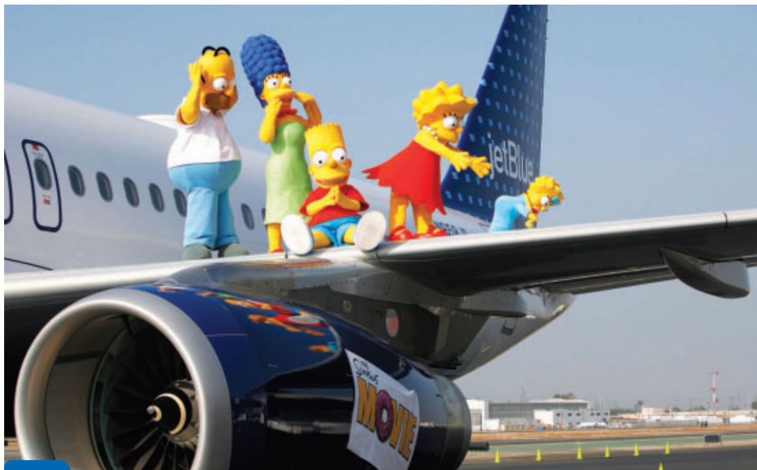
Cast members of The Simpsons Movie (from left: Homer, Marge, Bart, Lisa and Maggie) travel in style with JetBlue Airways, “The Official Airline Of Springfield.”

customers and sets us apart from other airlines. It helps explain why JetBlue is unique in a fun way.