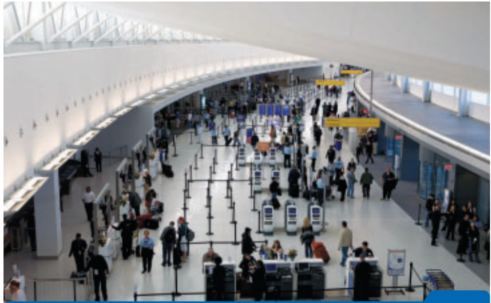
JetBlue Airways strives to achieve service excellence in the air as well as on the ground. Based out of New York JFK's Terminal 5, the airline offers simple check-in options, ample security lanes, sufficient seating at gates, free Wi-Fi, several dining and shopping venues, and a children's play area.

Q: What are some top reasons customers choose JetBlue rather than