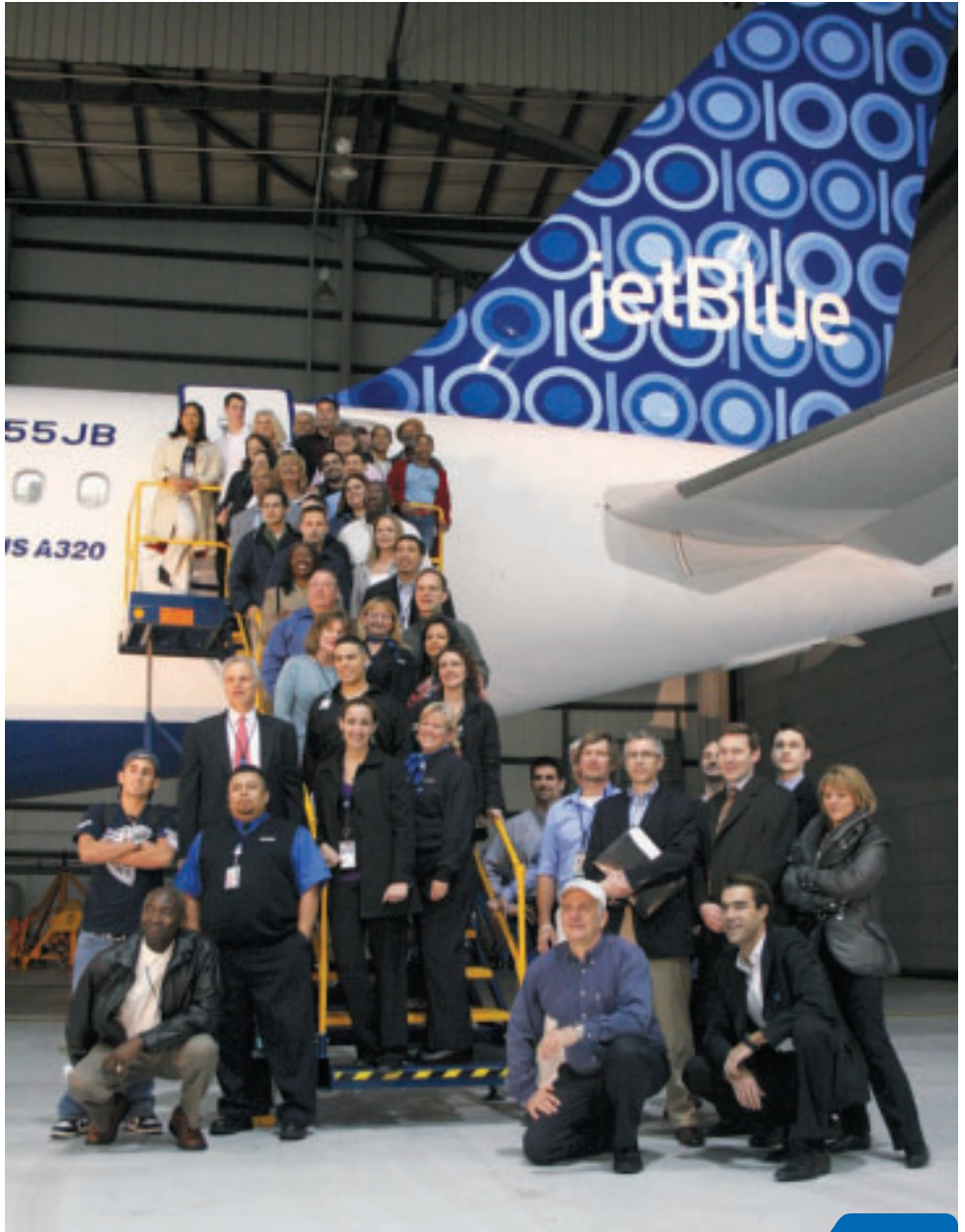
JetBlue not only takes good care of its customers, it offers a secure, enjoyable atmosphere for its 12,000 crewmembers, who work together as a team to ensure the best possible travel experience for all jetters.

A: We created the JetBlue Customer Bill of Rights in early 2007 after experiencing some operational challenges due to winter weather. We wanted to provide customers with a tangible document outlining exactly what they can expect