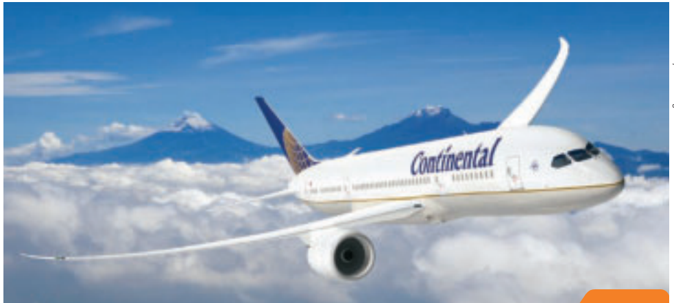
Virgin Atlantic, Air New Zealand, Japan Airlines (left) and Continental along with Boeing and engine manufacturers GE Aviation, Rolls-Royce and Pratt & Whitney have performed ground-breaking demonstration test flights on sustainable, plant-based fuels, which have proved the economic and environmental viability of biofuels.

Airbus’ track record includes fly-by-wire technology, development of composite struc-