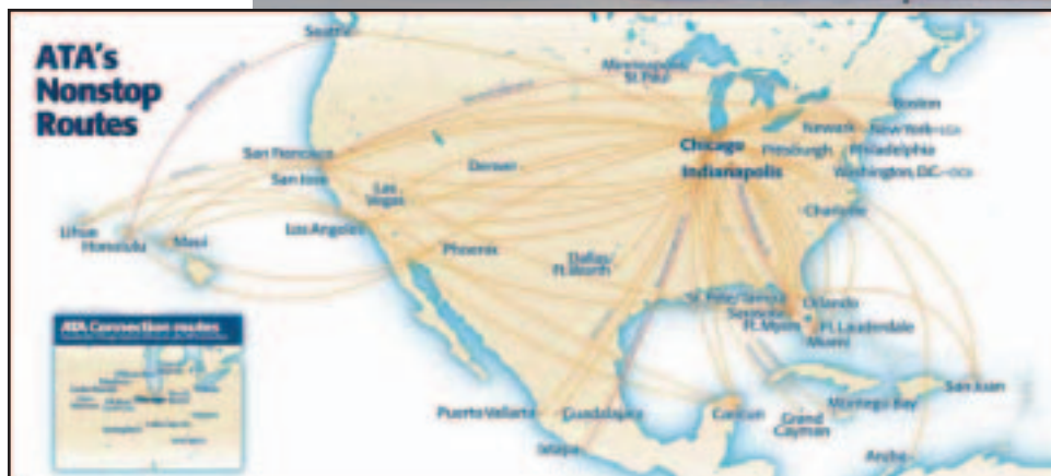
From its hub at Chicago Midway Airport, ATA Airlines flies nonstop to 33 destinations throughout North America and the Caribbean with its fleet of aircraft (above right) that includes the Boeing 737-800, 757-200 and 757-300. In 2003, the airline reported its first full-year profit since 1999, earning US$15.8 million.

The newer aircraft have helped dramatically improve operational dependability, on-time performance and passenger comfort. Also, the current mix of aircraft features a higher degree of fleet commonality, providing operational advantages that simplify training, support services and spare parts. But flying young, efficient, large planes on long missions is not the only strategy keeping ATA's low-cost carrier title safe.